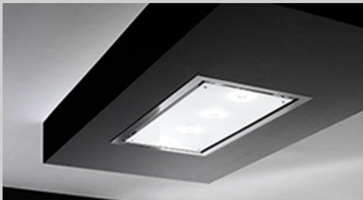
This photo is purely for information, it may not correspond to the selected version

900mm – Stainless Steel & Stainless Steel Frame – AMF13 Motor