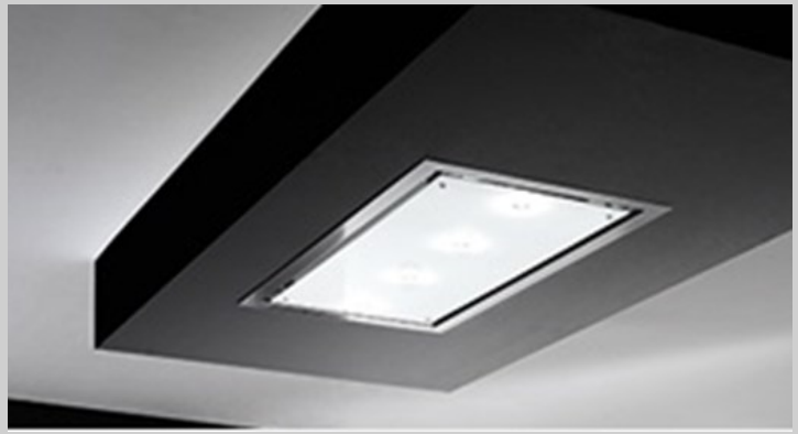
This photo is purely for information, it may not correspond to the selected version

900mm – Stainless Steel & Stainless Steel Frame – AMF10 Motor